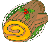
Winter begins, Dec. 22