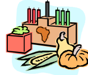
Kwanzaa begins, Dec. 26