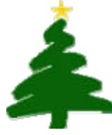
Christmas, Dec. 25