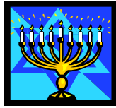
Hannukkah began Nov. 29, Sundown